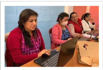
Teachers in Sololá, Guatemala learning how to use a Chromebook