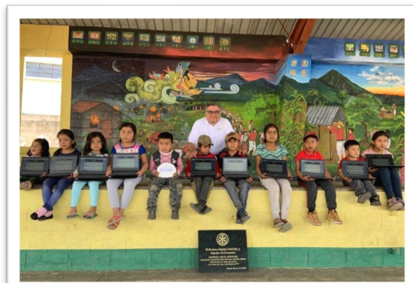
Students with Chromebooks in Sololá, Guatemala

Dark, No Meeting Due to Thanksgiving Holiday